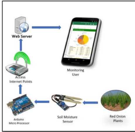
Fig. 1. Flow data acquisition

processed into time series data stored on the local database on the microprocessor by using internet network historical soil moisture data sent to the web server and stored in the database is then predicted which can be seen in Fig 1.