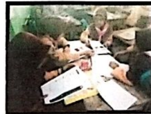
Figure 5: Cooperation in the group.