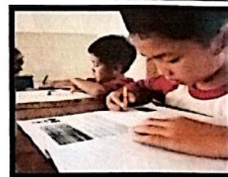
Figure 6: Students are doing the assignment given by the teacher.