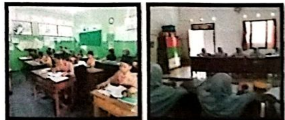
Figure 2: Praying together.