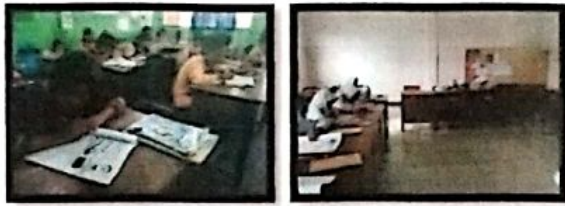
Figure 3: Do the assignment in the test book.