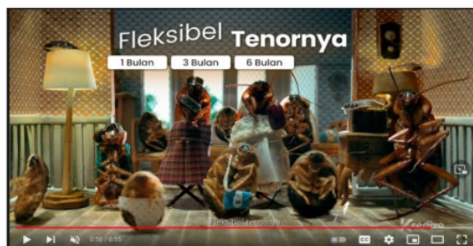
Figure 4: Part 4 of Kredivo commercial

At the end of Kredivo commercial entitled “Hidup #sefleksibleitu” appeared a group of cockroaches that dressed as humans in a living room. The narration of that scene is "fleksibel tenornya" which is translated as a flexible tenor. This scene bothers the researchers, therefore this part will discuss the relation of cockroaches to Kredivo's market target. Before discussing the relation, the denotative meaning of the environment, the cockroach and its costume, and