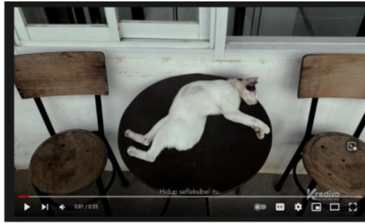
Figure 1: Scene 1 of the Kredivo commercial

Two pictures above are snipped from the beginning of the Kredivo “ Hidup #Seleksibelitu ” commercial. At the opening of the commercial, two different cats are shown in different places. The first cat is presented sleeping on a nice black sofa while the second cat is presented sleeping on a simple table located outside the room. It looks like the two cats sleep comfortably even though they are in different places. The opening of the commercial features a cat accompanied by the narration “Life as flexible as it can be”. The narration shows that two sleeping cats are living a flexible life which is presented by their flexibility to be able to sleep comfortably in two different places, the sofa and table.