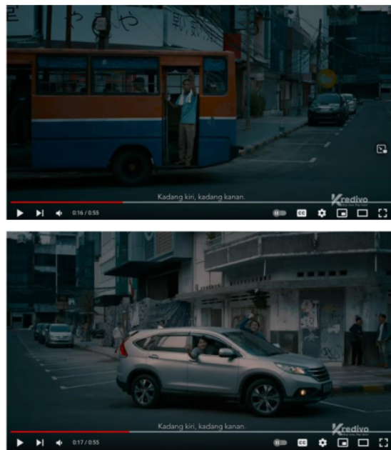
Figure 2: Scene 2 of the Kredivo commercial