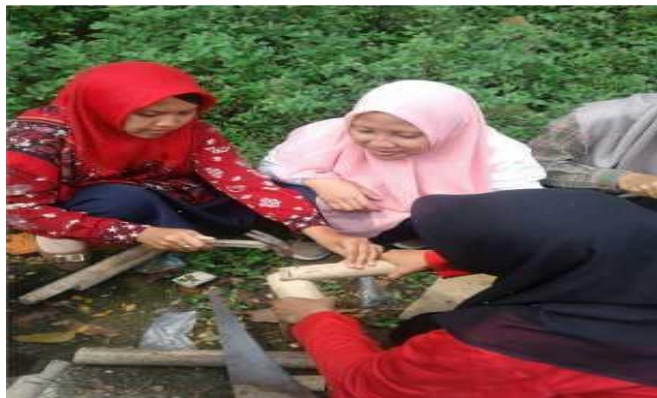
Picture 3 The practice of making plant nutrients from organic waste

C. Provide students with skills on hydroponic herbal plant cultivation;