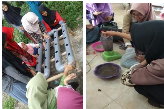
Practice making pipes and cotton for hydroponic growing media

There are many hydroponic methods but this herbal hydroponic cultivation uses the NFT (Nutrient Film Technique) System. The concept works by placing the plant in a tube-shaped place where the roots will hang on the plant nutrients. This system does not require tools to pump nutrients because nutrients will flow continuously along with the flow of water. The most important part of the hydroponic growing system is the fulfillment of the nutrients needed by the plants. NFT is suitable for leafy plants. Herbs used in this hydroponic cultivation are chili peppers, red spinach, betel leaves, cucumber and celery.