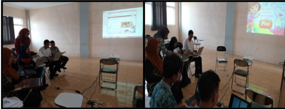
Figure 2. Initial Field Trial of the IT-Based Educational Game Learning Training Module

After testing a small group and making a few revisions based on the suggestions of the participants, the training modules are ready to be used in the main field trials, which are the teachers at MI Al Asy'ari Keras Jombang. Similar to the initial field trial, the researcher obtained positive results from the participant toward the trainee, the implementation of the training, and the training facilities including the training modules which were in the very good category at 94.41%. As for the results of the posttest, of the 26 participants, there were two participants whose grades were below the completeness criteria of 65. Even so, classically the training module could be declared effective because it had reached the classical completeness criteria set at the training at MI Al Asy'ari which is \geq 80\% which in the amount of 92.3%. As for the incompleteness of the participants who took part in the posttest both in the initial and main field trials, this was due to inaccuracy in reading the questions so that there were questions that were missed and not being answered. For example, in the posttest questions number 1 to 3, here the researcher ask the participant to give each example. However, the participants only explained their definition and theory. Thus can reduce the points. On the other hand, there are some numbers that are incomplete explanation.