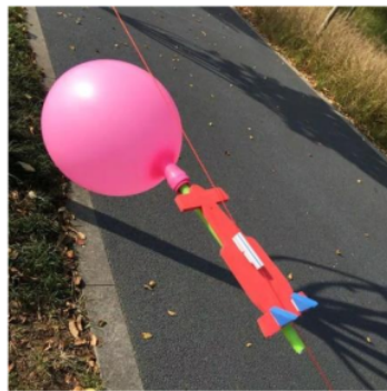
Figure 5. Simple Rocket Instructional Aid

It was made of foam, fishing line, straw, and baloon. This simple baloon rocket works if installed balloons and straws will take off on the fishing line until the air in the balloon is completely depleted when the balloon is released, the air will be compressed and go into space so that the balloon will advance like a rocket. The working principle of the rocket is in accordance with Newton III Law theory "For each force of action, will produce the same reaction force but the opposite direction". It is commonly referred to as "Action = reaction" style. Simple rocket instructional aid can be seen in Figure 5.