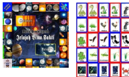
Figure 2. Types of Learning Media Made by Students

Some learning media created by students can be seen in Figure 2.