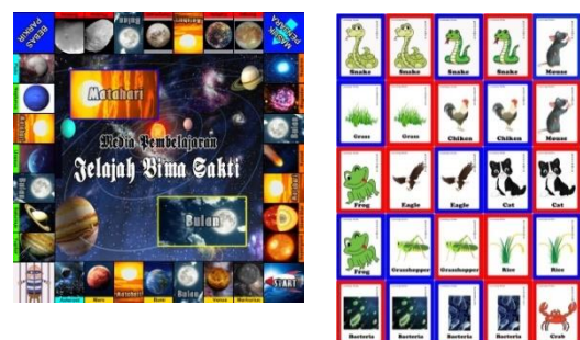
Figure 2. Types of Learning Media Made by Students

Some learning media created by students can be seen in Figure 2.