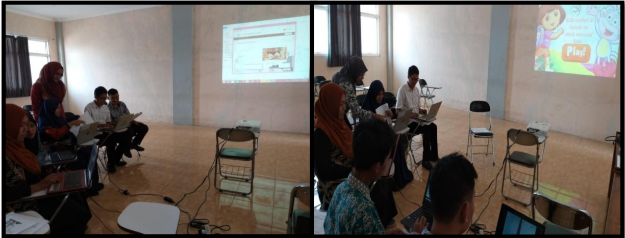
Figure 2. Initial Field Trial of the IT-Based Educational Game Learning Training Module

After testing a small group and making a few revisions based on the suggestions of the participants, the training modules are ready to be used in the main field trials, which are the teachers at MI Al Asy'ari Keras Jombang. Similar to the initial field trial, the researcher obtained positive results from the participant toward the trainee, the implementation of the training, and the training facilities including the training modules which were in the very good category at 94.41%. As for the results of the posttest, of the 26 participants, there were two participants whose grades were below the completeness criteria of 65. Even so, classically the training module could be declared effective because it had reached the classical completeness criteria set at the training at MI Al Asy'ari which is \geq 80\% which in the amount of 92.3%. As for the incompleteness of the participants who took part in the posttest both in the initial and main field trials, this was due to inaccuracy in reading the questions so that there were questions that were missed and not being answered. For example, in the posttest questions number 1 to 3, here the researcher ask the participant to give each example. However, the participants only explained their definition and theory. Thus can reduce the points. On the other hand, there are some numbers that are incomplete explanation.