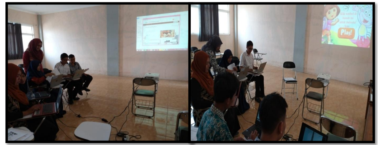
Figure 2. Initial Field Trial of the IT-Based Educational Game Learning Training Module

After testing a small group and making a few revisions based on the suggestions of the participants, the training modules are ready to be used in the main field trials, which are the teachers at MI Al Asy'ari Keras Jombang. Similar to the initial field trial, the researcher obtained positive results from the participant toward the trainee, the implementation of the training, and the training facilities including the training modules which were in the very good category at 94.41%. As for the results of the posttest, of the 26 participants, there were two participants whose grades were below the completeness criteria of 65. Even so, classically the training module could be declared effective because it had reached the classical completeness criteria set at the training at MI Al Asy'ari which is \geq 80% which in the amount of 92.3%. As for the incompleteness of the participants who took part in the posttest both in the initial and main field trials, this was due to inaccuracy in reading the questions so that there were questions that were missed and not being answered. For example, in the posttest questions number 1 to 3, here the researcher ask the participant to give each example. However, the participants only explained their definition and theory. Thus can reduce the points. On the other hand, there are some numbers that are incomplete explanation.