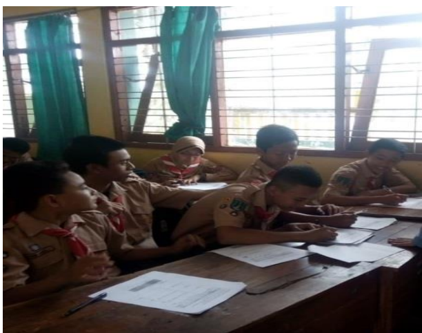
Figure 2. Classifying and concluding activities