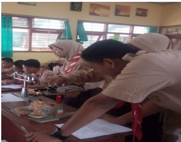
Figure 1. Students are measuring food ingredients

Based on Table 6, it can be seen that the average percentage of students' science process skills in the cycle I reached 73.03% in the "skilled" category and increased in the cycle II to 82.36% in the "very skilled" category. The increase in the category of science process skills occurred in the "classify" aspect of 79.1% with the "skilled" category in the cycle I to 85.5% in the cycle II with the "very skilled" category. In addition, it also occurred in the "conclude" aspect, which was 57.5% in the "skilled enough" category to 76.5% in the "skilled" category.