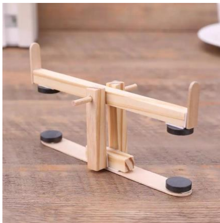
Figure 3. Seesaw Instructional Aid