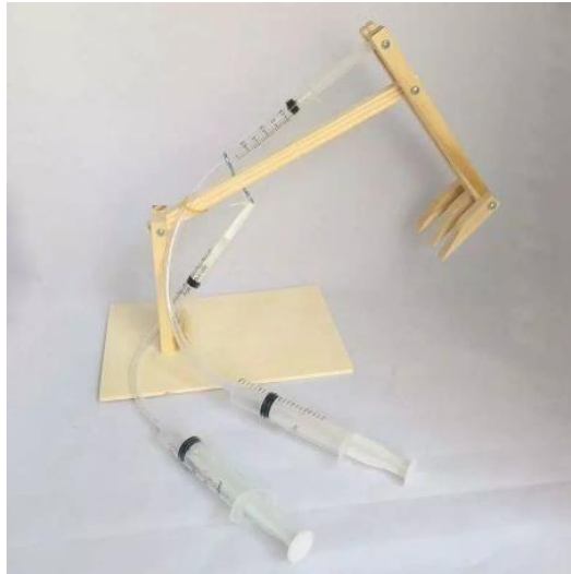
Figure 2. Simple Hydraulic Arm Instructional Aid

It was made of a popsicle stick, magnetic bar, and piece of wood. Seesaw employs the principle of equilibrium and first class levers with the fulcrum position that lies between the load and the power. Equilibrium at the seesaw is a condition where the load is balanced by power and the fulcrum is the main key in forming equilibrium. If the burden is heavier than the power, the seesaw will tilt towards the load. Static equilibrium in this visual aid occurs if the force acting on the object is equal to (0) and the amount of torque against any point on the object is equal to zero. Stiff body balance requirements If the forces acting on the xy plane. Simple seesaw instructional aid can be seen in Figure 3.