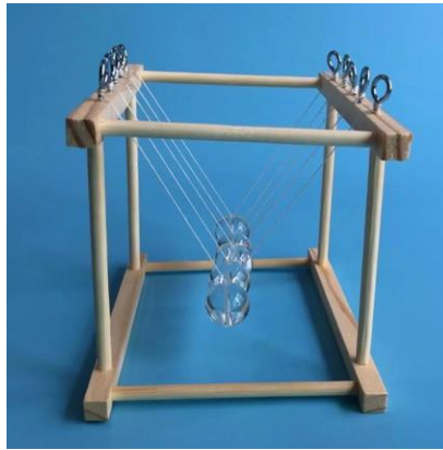
Figure 4. Simple Pendulum