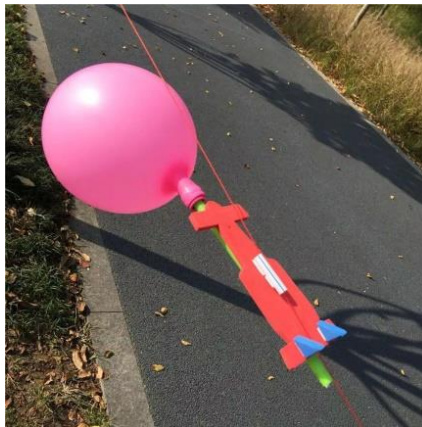
Figure 5. Simple Rocket Instructional Aid

It was made of foam, fishing line, straw, and balloon. This simple balloon rocket works if installed balloons and straws will take off on the fishing line until the air in the balloon is completely depleted when the balloon is released, the air will be compressed and go into space so that the balloon will advance like a rocket. The working principle of the rocket is in accordance with Newton III Law theory "For each force of action, will produce the same reaction force but the opposite direction". It is commonly referred to as "Action = reaction" style. Simple rocket instructional aid can be seen in Figure 5.